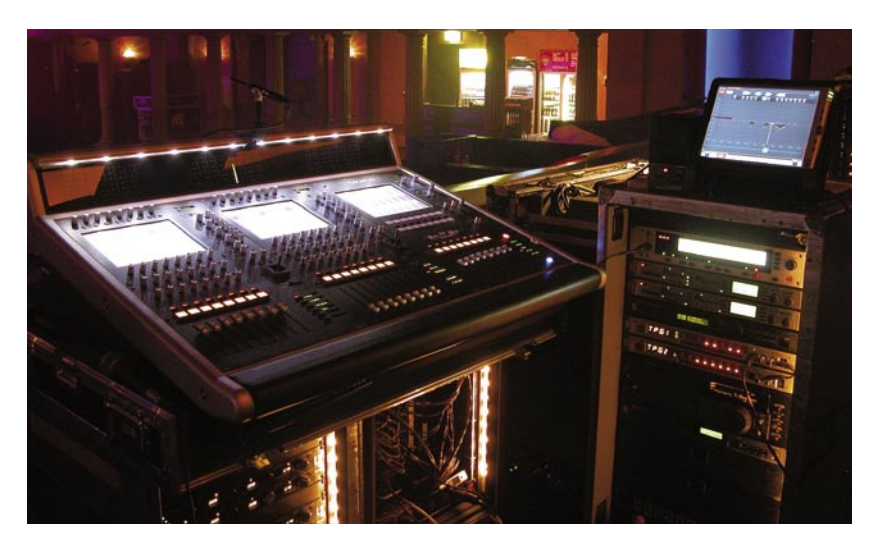
The FOH position, dominated by the Digico D1. You'll notice the Clair IO in the rack. It was used purely for its EQ; the PA system control was all done from within the Digico D1.

slap her on the fanny, send her on stage and she's good to go.